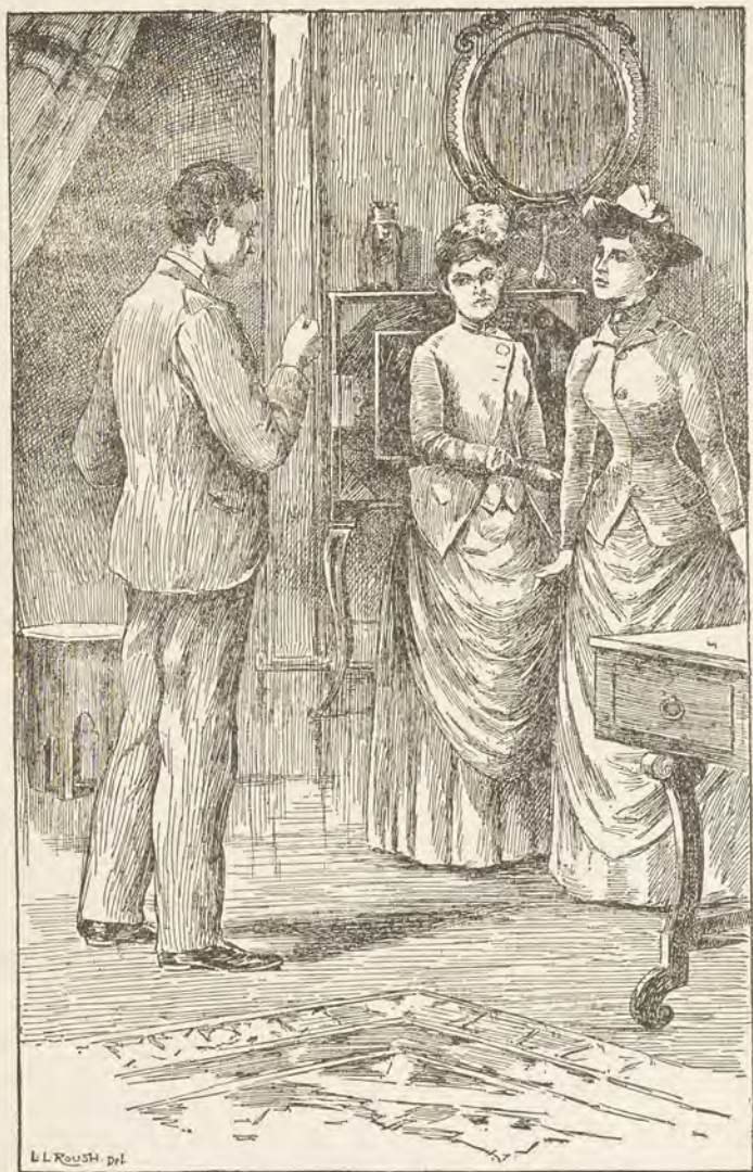
"SAM EXAMINED THE RUBY RING FROM EVERY POINT OF VIEW."