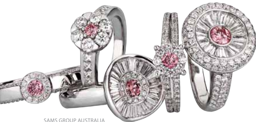
SAMS GROUP AUSTRALIA