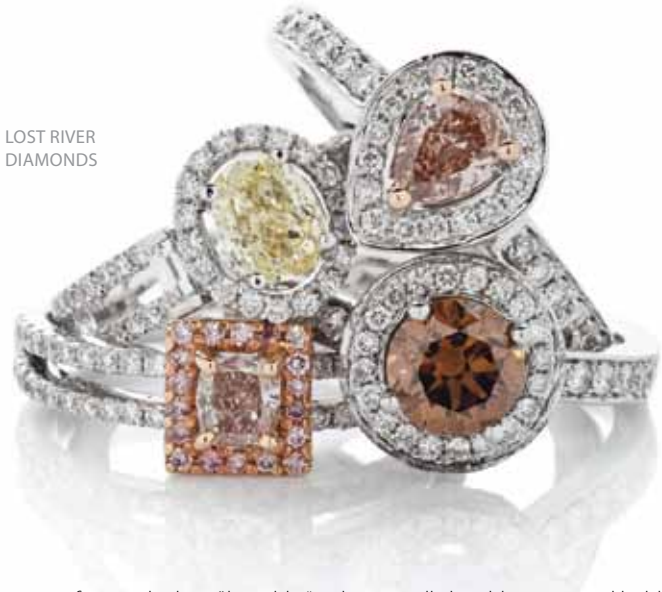
LOST RIVER DIAMONDS

premium for good advice," he adds, "and to actually be able to see and hold the stone for themselves. I have found that there is no harm in asking a customer in your store, who is giving you online prices to compete with, if they would really be prepared to buy a coloured diamond sight unseen."