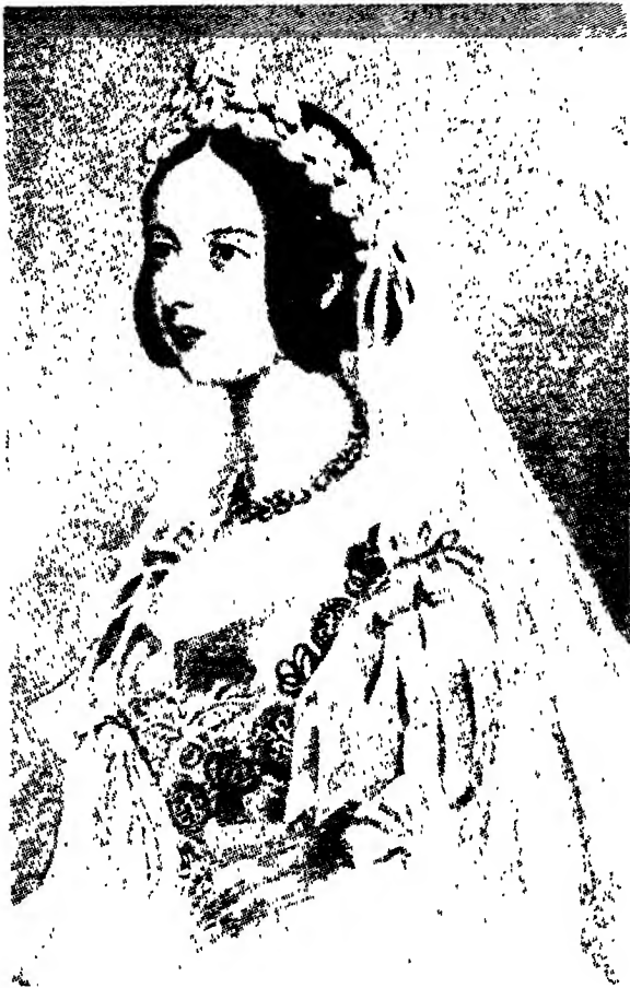
QUEEN VICTORIA IN 1840

“Ten years later the East India Company presented the Koh-i-Noor to Her Majesty, who included it in the ‘Crown Jewels’ as the most brilliant and the most precious diamond of the world.”