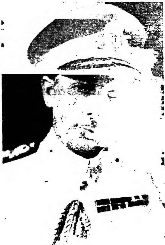
LORD LOUIS MOUNTBATTEN