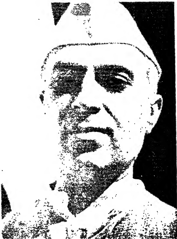
Mr. JAWAHARLAL NEHRU

“It is an amusing fact that Mr. Jawahar Lal Nehru, the first Prime Minister of Free India, has made no mention of the Koh-i-Noor in any form in any of his remarkable books on Indian and World History. Presumably he is not interested in things which are dead as stones. And the Koh-i-Noor is after all a stone, just as a King is after all a man and a Queen is after all a woman.”