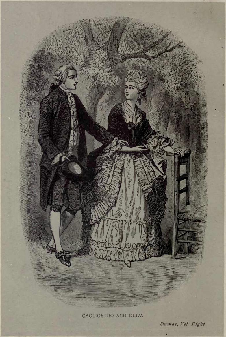
CAGLIOSTRO AND OLIVA