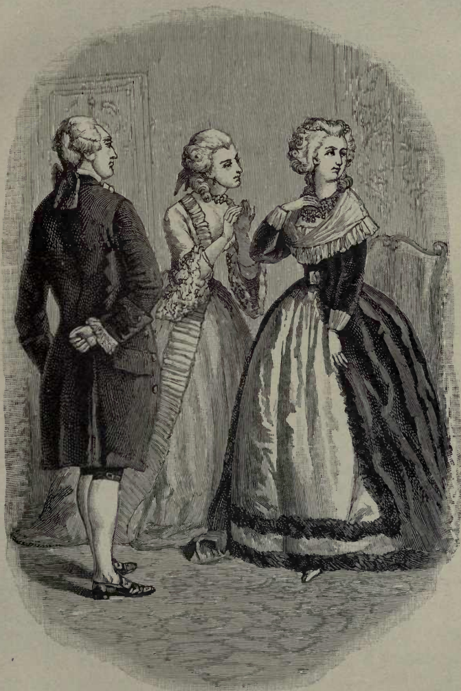
THE QUEEN'S NECKLACE