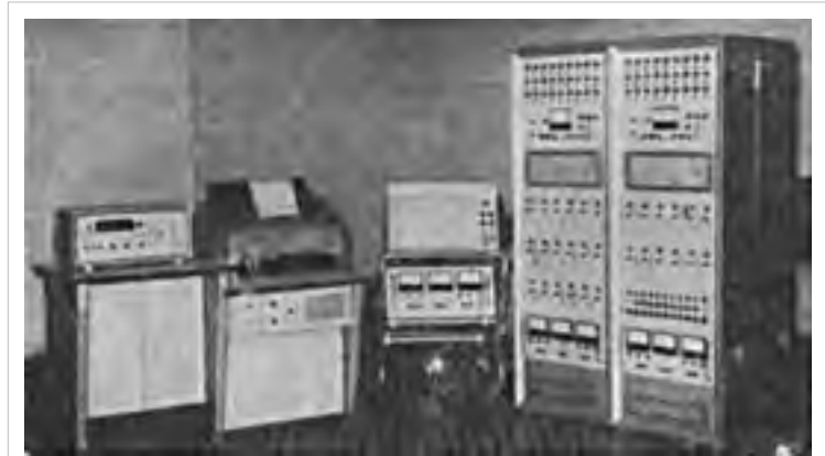
Polish Analog computer ELWAT.

Any physical process which models some computation can be interpreted as an analog computer. Some examples, invented for the purpose of illustrating the concept of analog computation, include using a bundle of spaghetti as a model of sorting numbers ; a board, a set of nails, and a rubber band as a model of finding the convex hull of a set of points ; and strings tied together as a model of finding the shortest path in a network . These are all described in A.K.