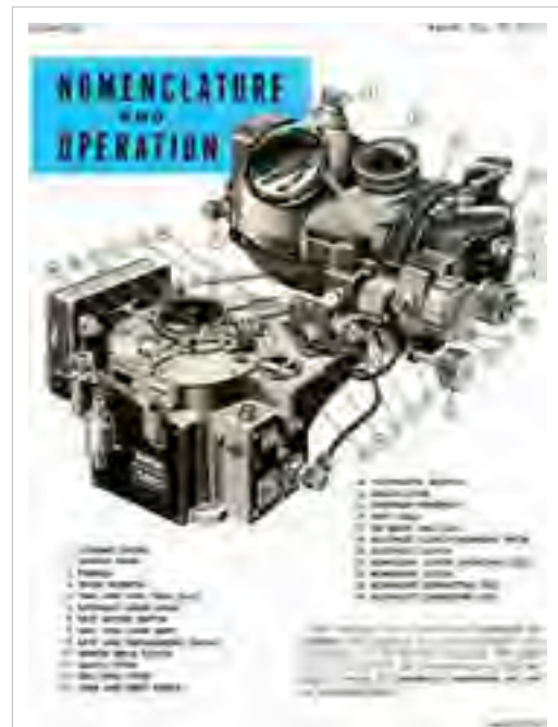
A page from the Bombardier's Information File (BIF) that describes the components and controls of the Norden bombsight. The Norden bombsight was a highly sophisticated optical/mechanical analog computer used by the United States Army Air Force during World War II, the Korean War, and the Vietnam War to aid the pilot of a bomber aircraft in dropping bombs accurately.

Many mechanical aids to calculation and measurement were constructed for astronomical and navigation use. The planisphere was a star chart invented by Abū Rayhān al-Bīrūnī in the early 11th century. [1] The astrolabe was invented in the Hellenistic world in either the 1st or 2nd centuries BC and is often attributed to Hipparchus. A combination of the planisphere and dioptra, the astrolabe was effectively an analog computer capable of working out several different kinds of problems in spherical astronomy. An astrolabe incorporating a mechanical calendar