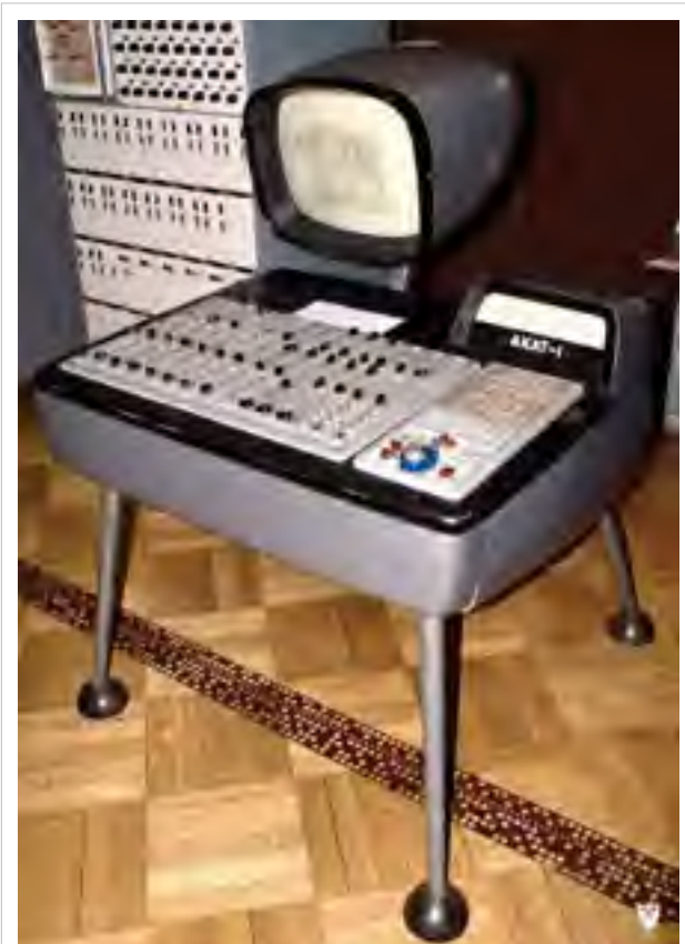
Polish analog computer AKAT-1

The electrical equivalent can be constructed with a few operational amplifiers (Op amps) and some passive linear components; all measurements can be taken directly with an oscilloscope. In the circuit, the (simulated) 'stiffness of the spring', for instance, can be changed by adjusting a potentiometer. The electrical system is an analogy to the physical system, hence the name, but it is less expensive to construct, generally safer, and typically much easier to modify.