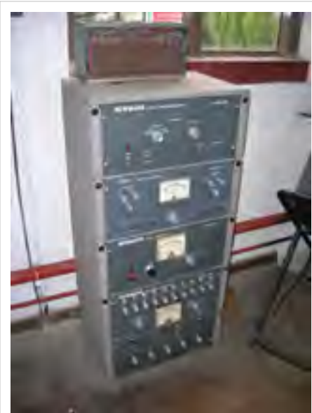
A 1960 Newmark analogue computer, made up of five units. This computer was used to solve differential equations and is currently housed at the Cambridge Museum of Technology.