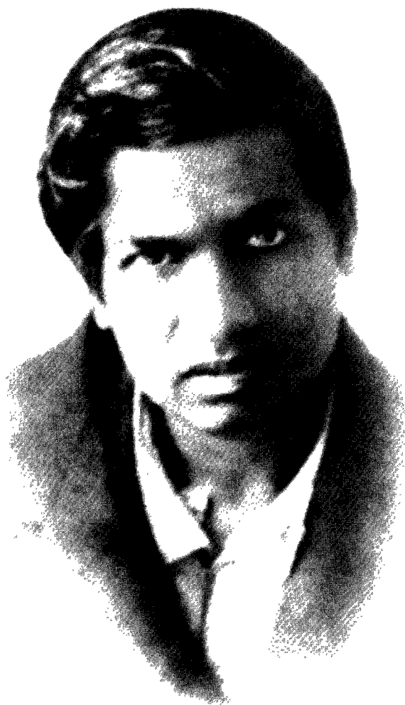
S. Ramanujan, 1919 (From G. H. Hardy, Ramanujan, Twelve Lectures on Subjects Suggested by His Life and Work. Cambridge University Press, 1940.)