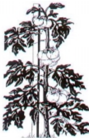
Figure 1. Remove plant "suckers" as the plants grow.

(2 \times 3.14 \times r) where r is the radius -or- (3.14 \times d) where d is the diameter